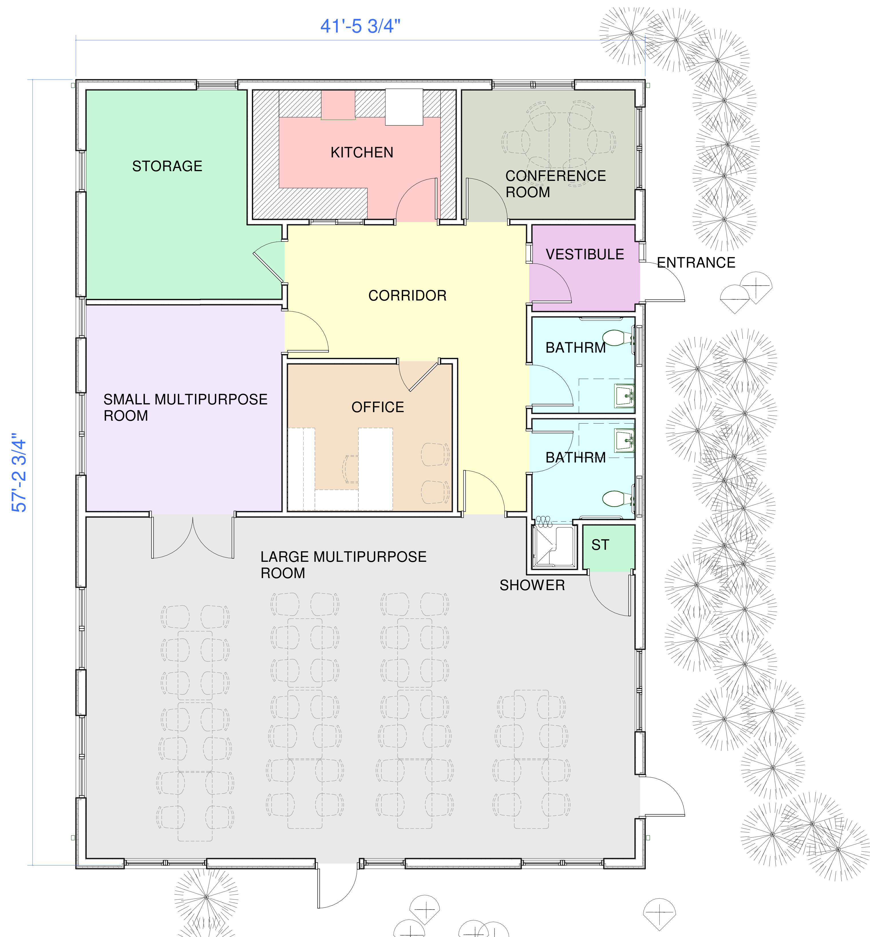
2 A1.1 MAIN LEVEL PLAN - 2,337 SQFT 1/4" = 1'-0"