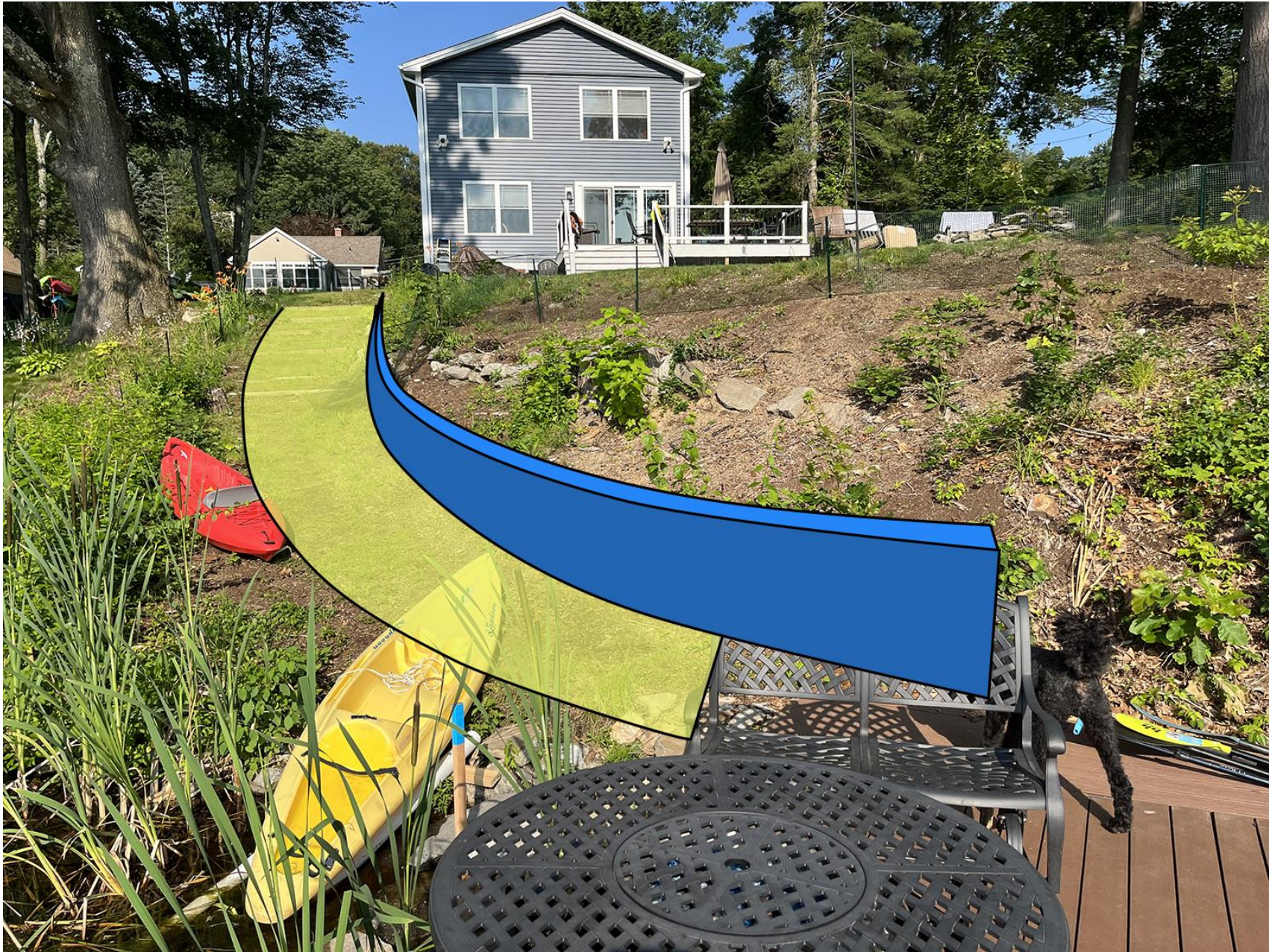
1 Proposed location of stone retaining wall construction and wood stair replacement near the shoreline of Andover Lake (visible in foreground).