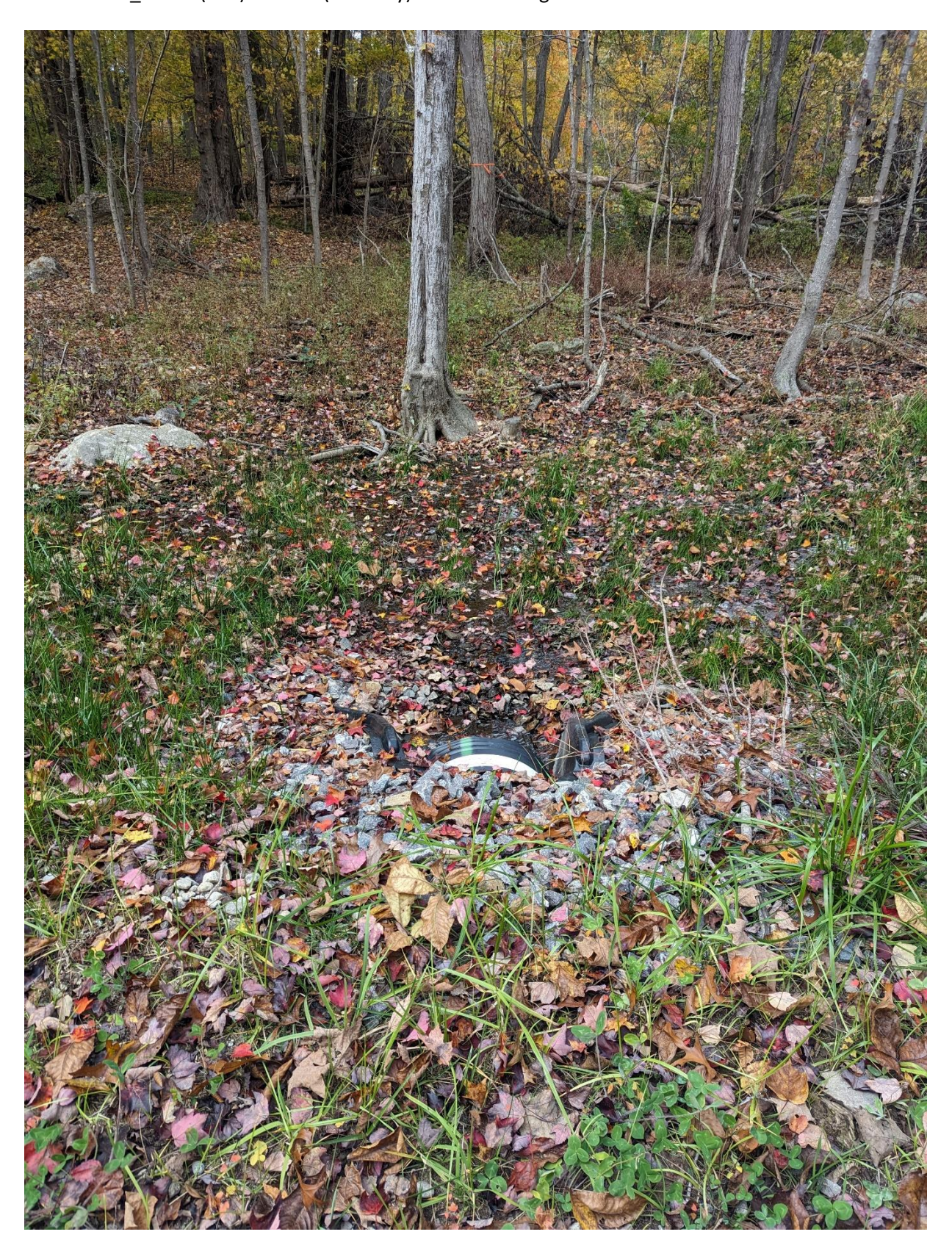
5- View of inlet on upstream (north) side of wetlands crossing.