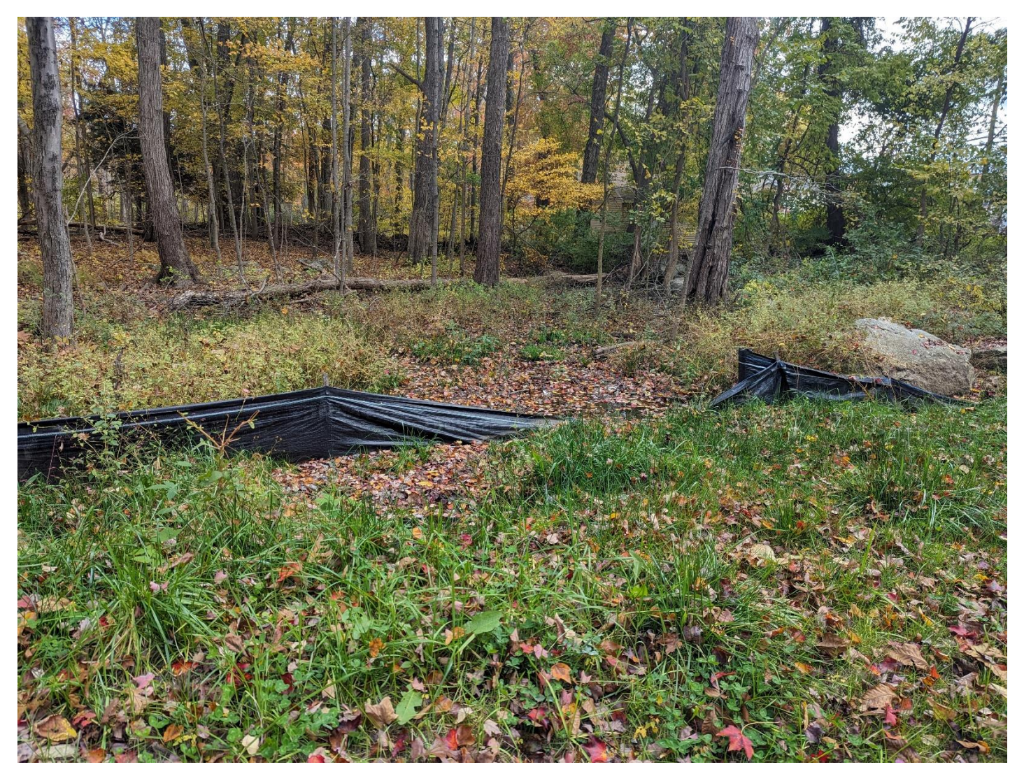
3- View of downstream (south) side of wetlands crossing.