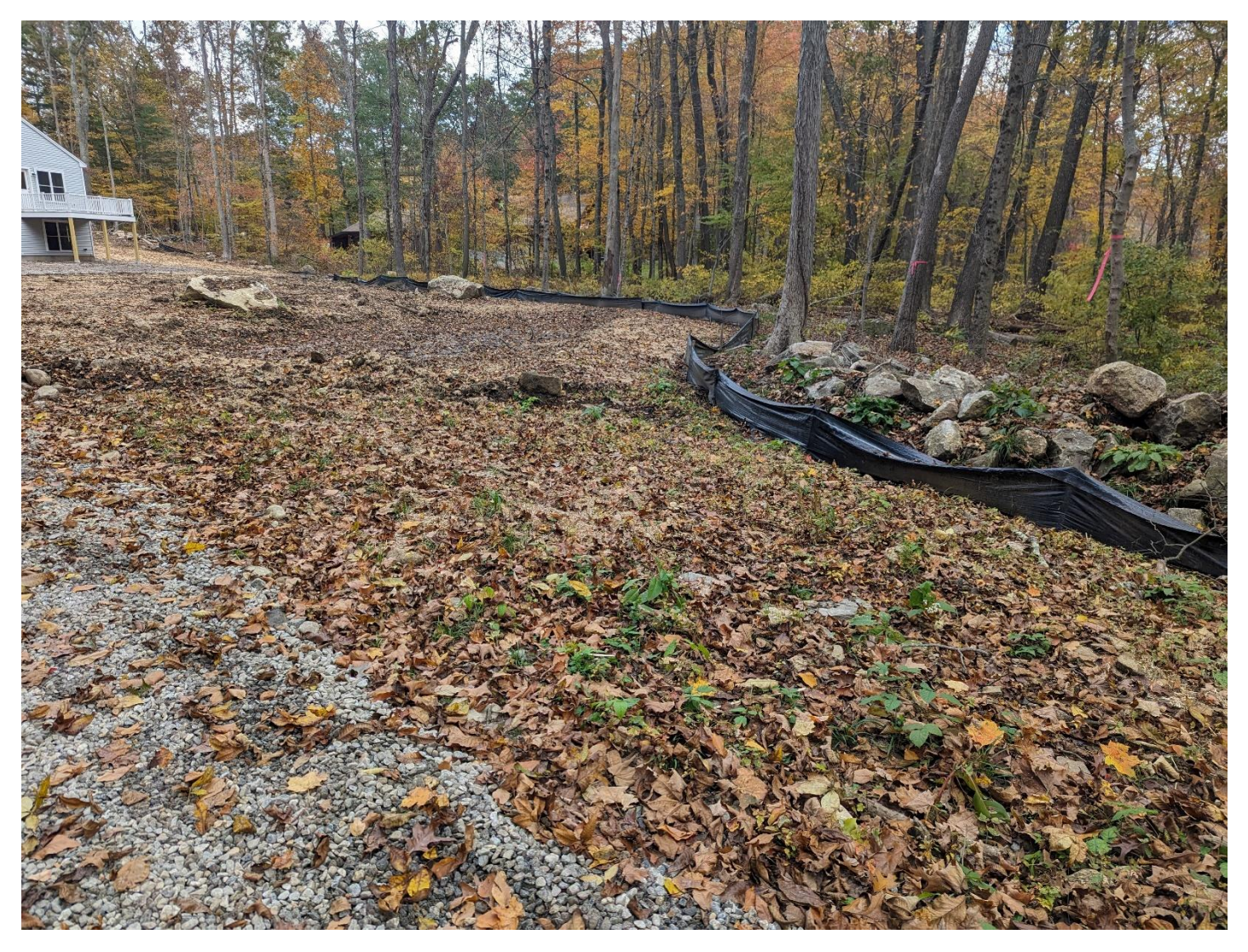
8- View of rain garden, as seen from driveway.