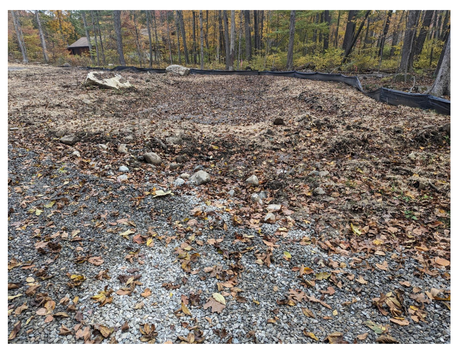
1- View of rain garden, looking south from driveway.