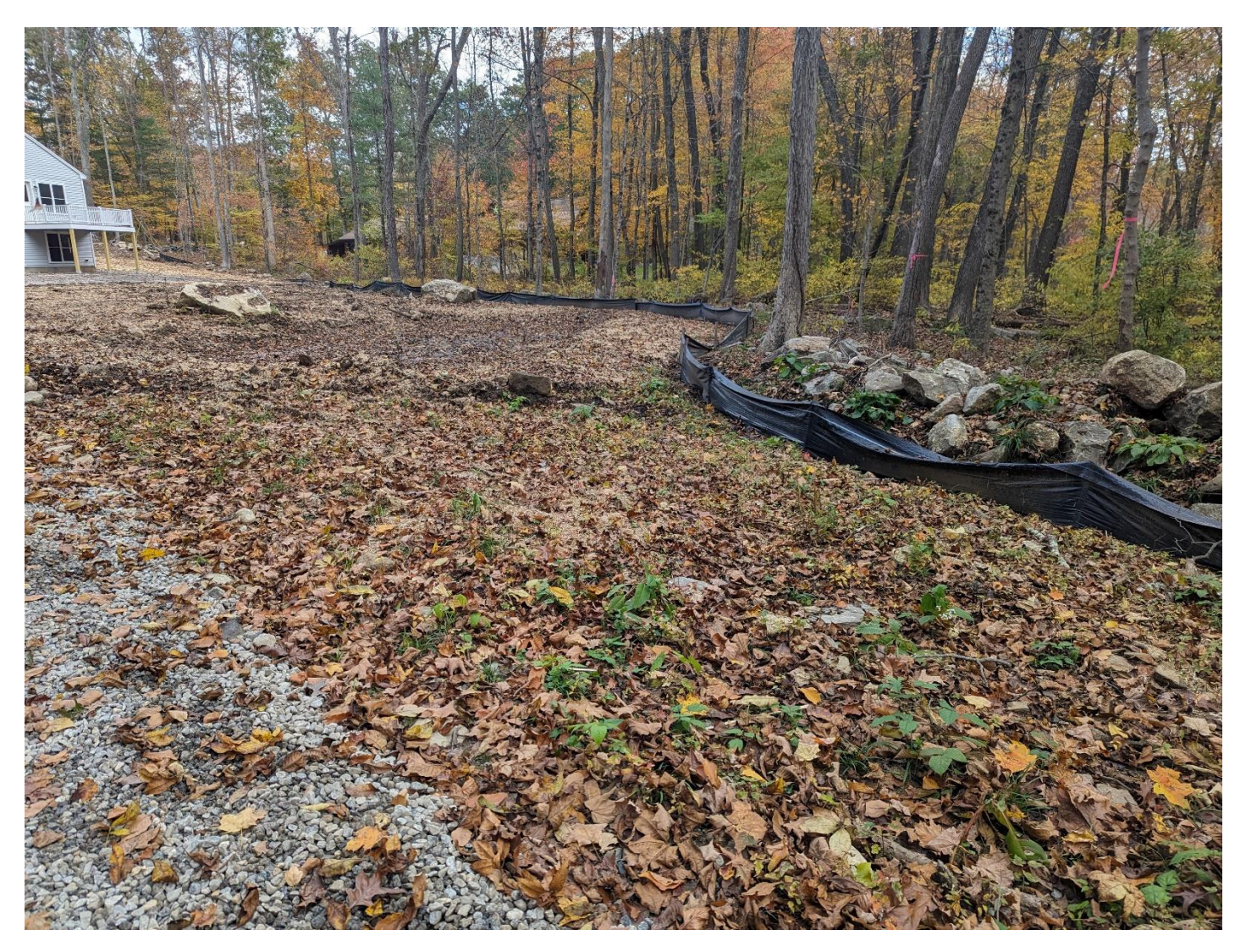
2- View of rain garden, as seen from driveway. Erosion control fencing should be removed when adequate ground cover has been established.