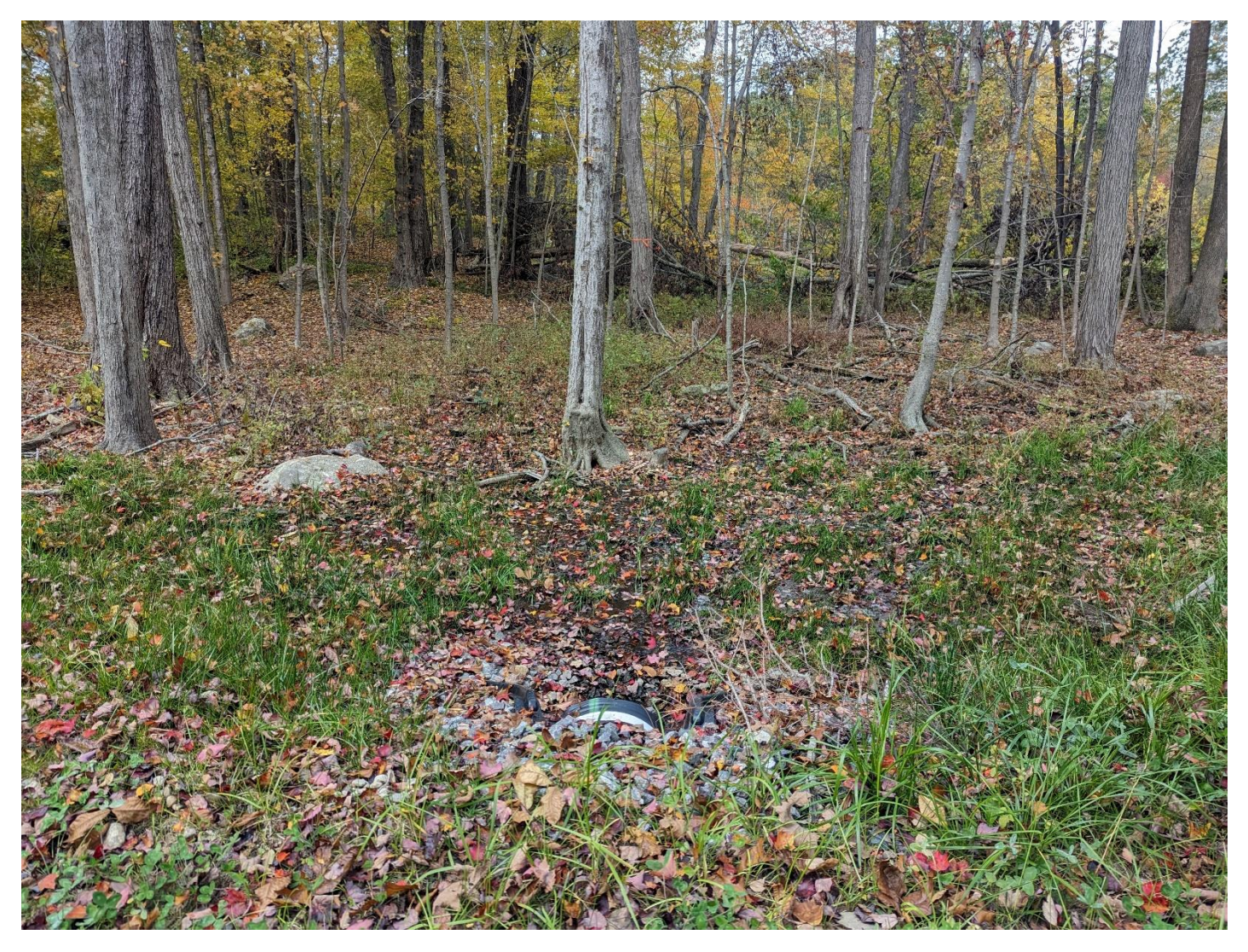
4- View of inlet on upstream (north) side of wetlands crossing.