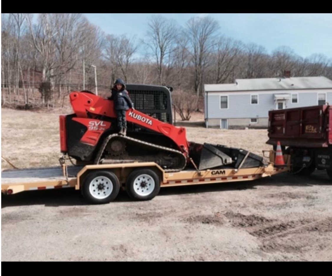
1- Picture of Rubber-tracked machine used to move stone to work site.

IWWC21-27_3 Lakeside Dr (McCullough) Picture of equipment to be used by contractor and example of proposed stone wall type. Submitted 03-02-2022