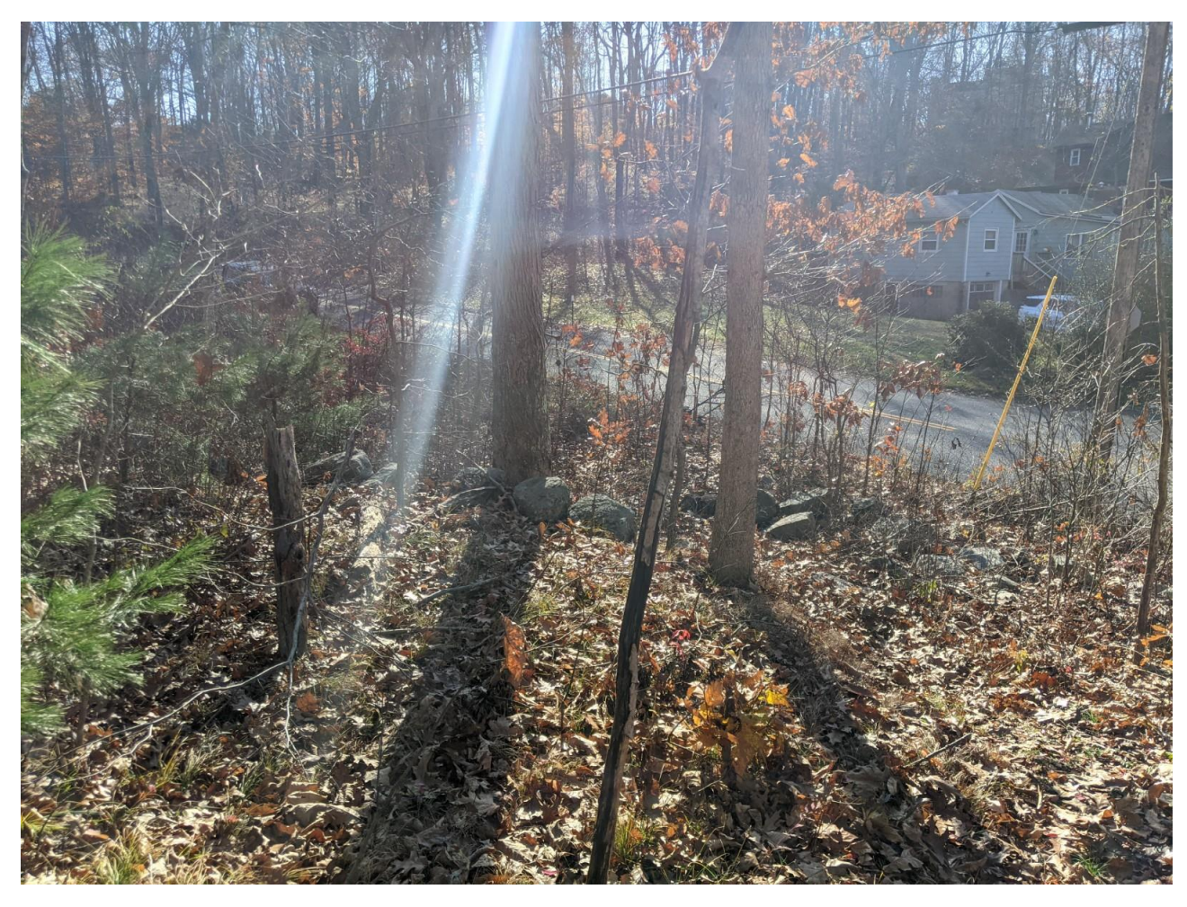
2 Looking downhill (southwest) toward area of stone culvert south of driveway entrance onto West St.