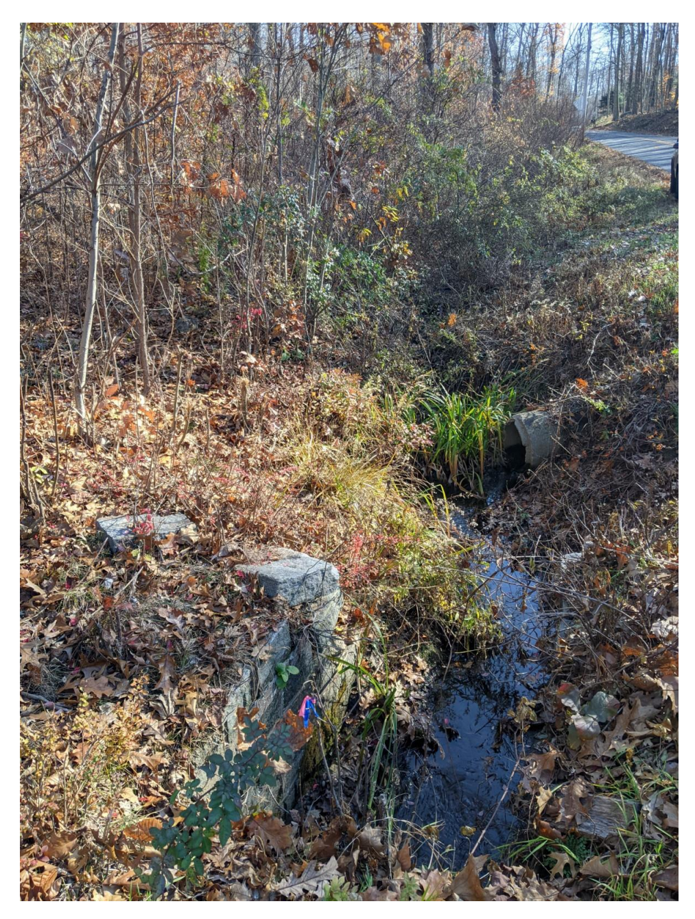
5 View of stone culvert and brook to the south and upstream of the proposed driveway.