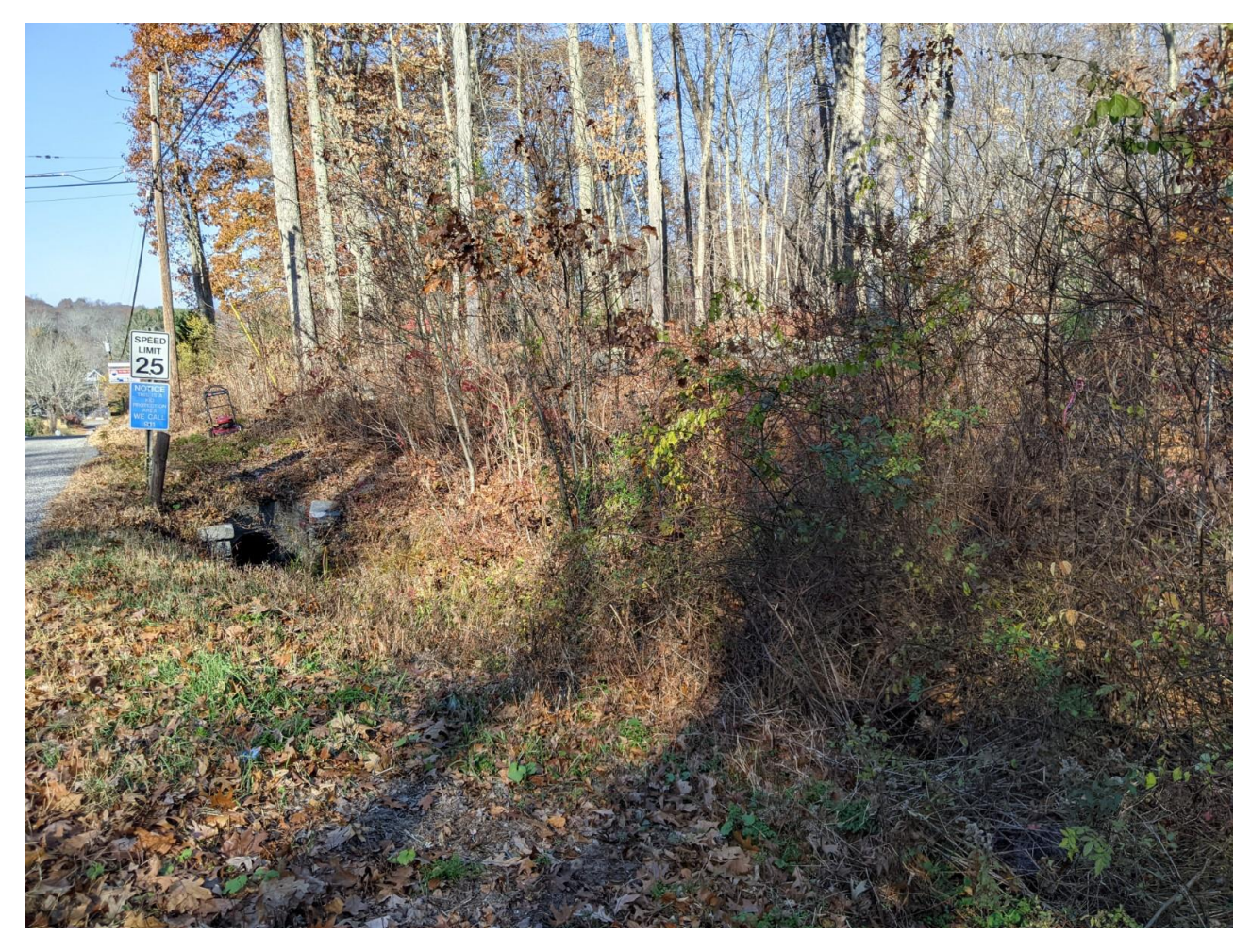
1 View of Stone Culvert. Looking northwest along West St. Proposed Driveway is downhill from culvert past CL&P pole #271.