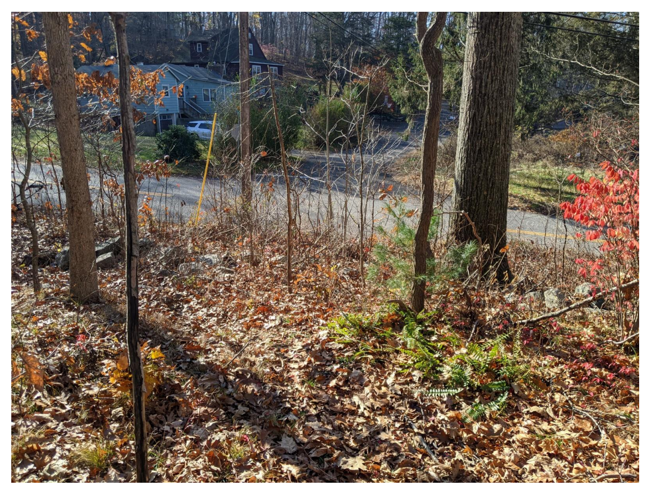
3 Looking downhill (west) toward driveway entrance onto West St.