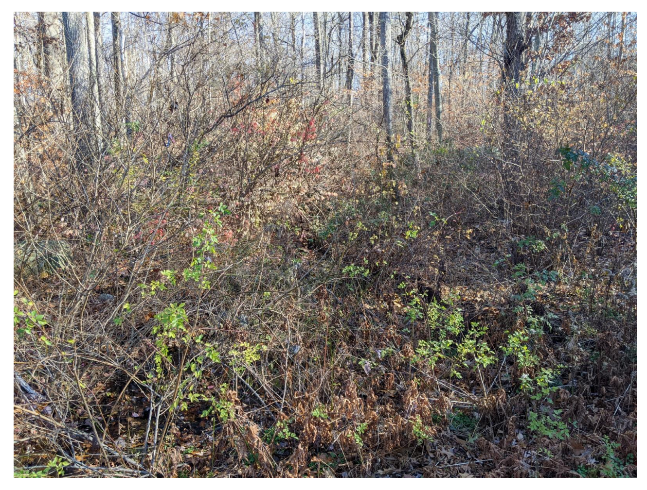
6 View of brook and surrounding brush upstream of the stone culvert. West St. is to the right of the picture.