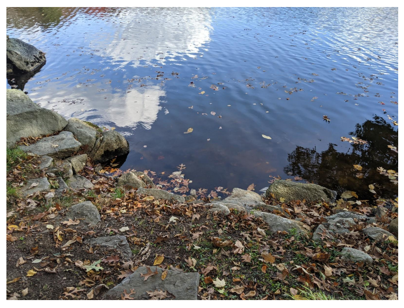
8- View of the stone steps to be rebuilt, as viewed from the west.