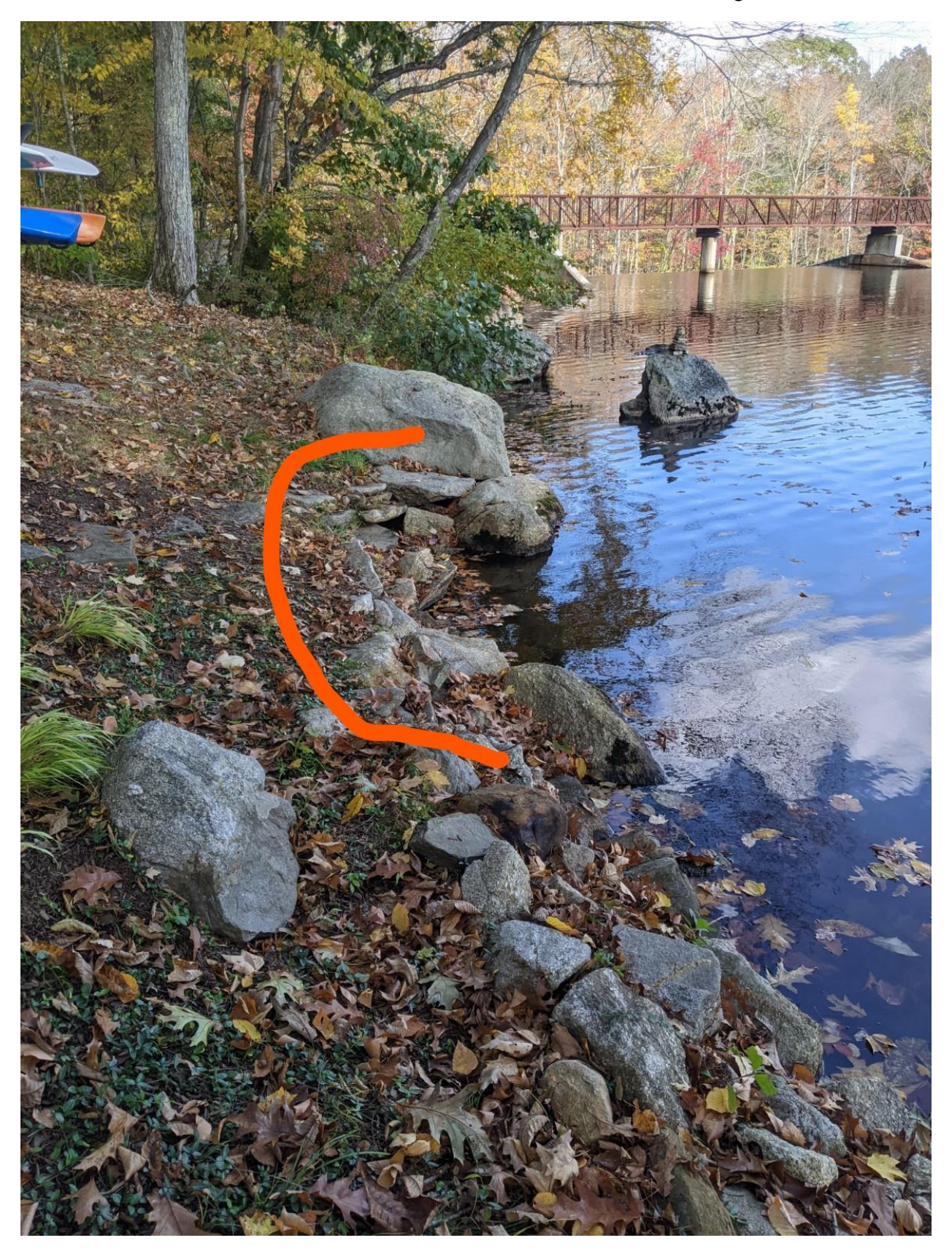
4- Stone steps to be rebuilt, viewed from the south. Steps are highlighted in orange.