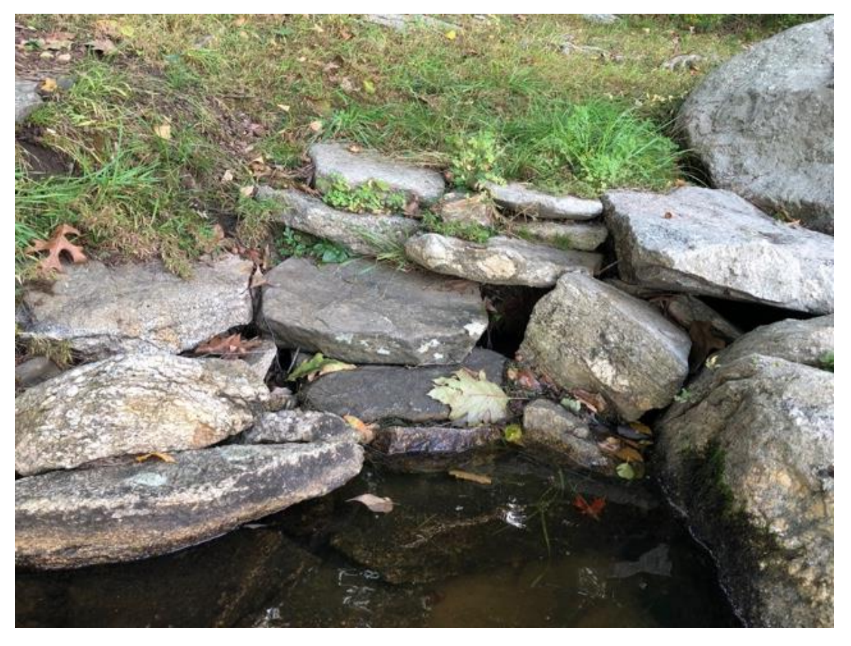
2- Close-up view of stone steps to be rebuilt as seen from lake.