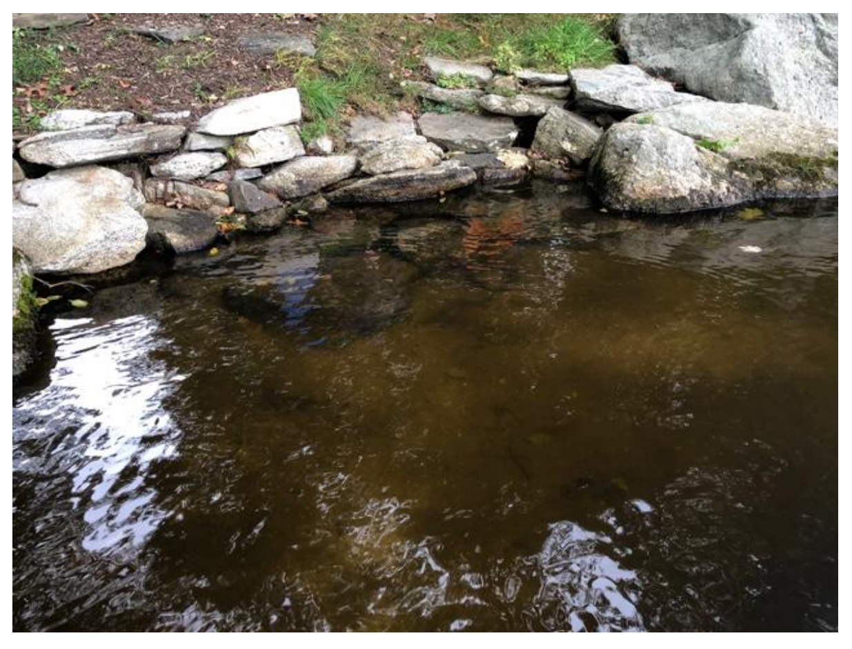
3- Another view of stone steps to be rebuilt as seen from lake.