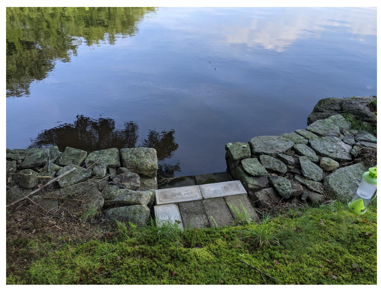
5- View of existing steps and wall.