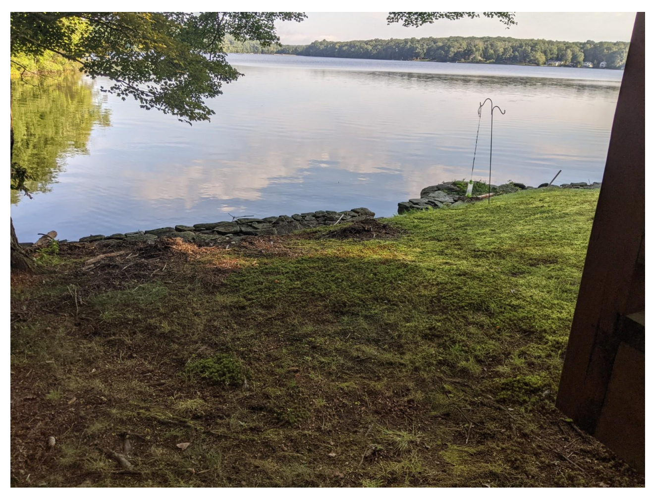
8- View of existing wall from western edge of the deck.