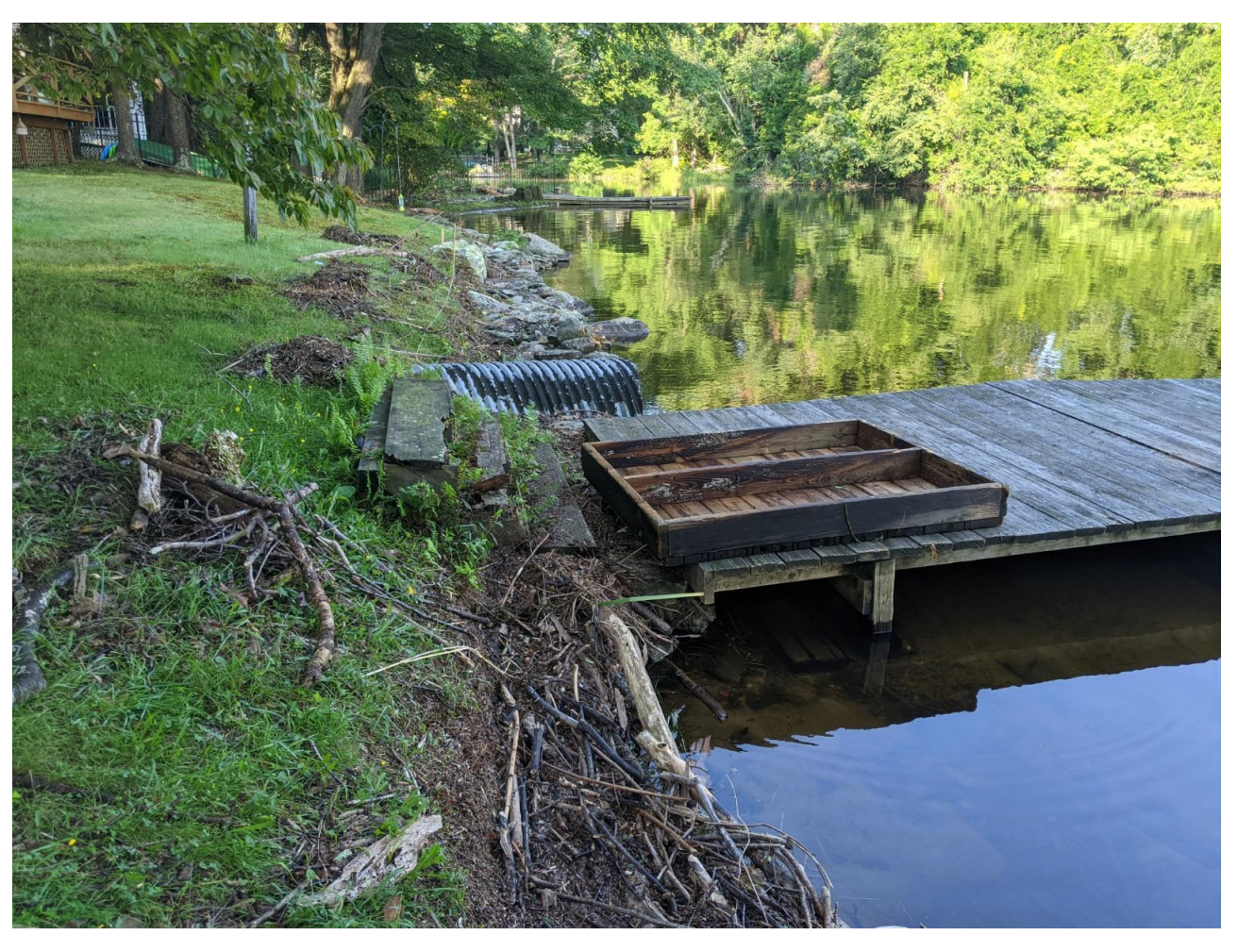
4- View of existing wall near eastern edge of property looking west.