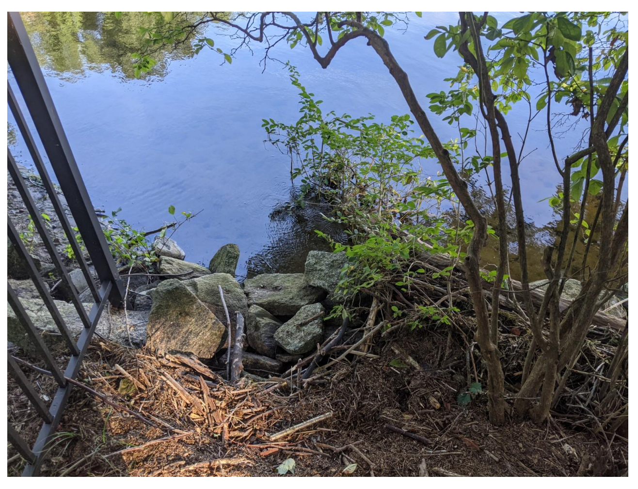
6- View of western edge of existing wall.