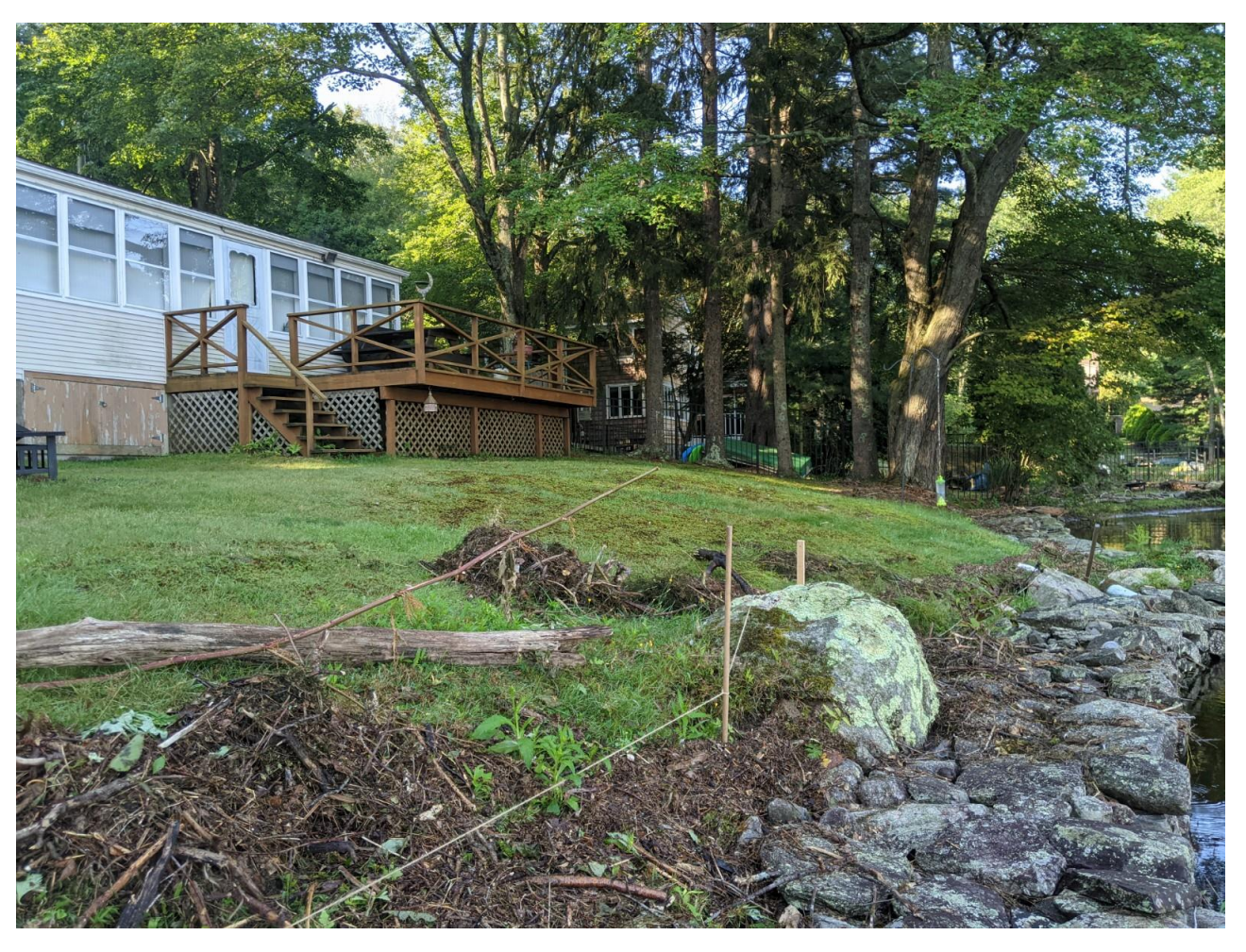
9- View of existing wall from eastern edge looking southwest toward house and lawn.