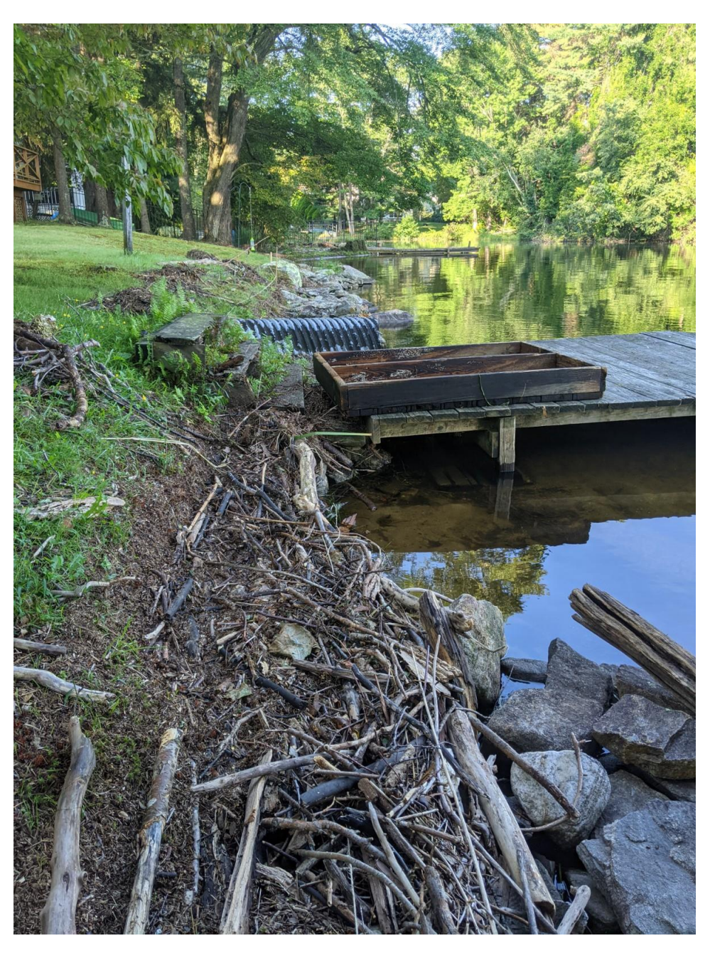
3- View of existing wall from eastern edge of property looking west.