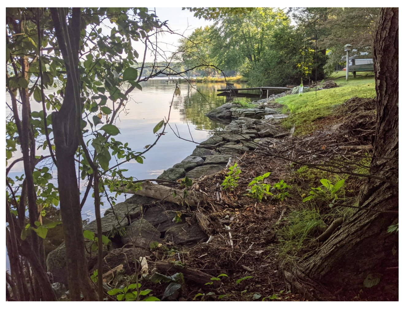
7- View of existing wall from western edge of property looking east.