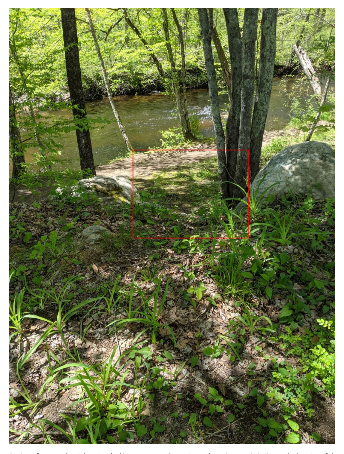
3- View of proposed stair location, looking west toward Hop River. The red rectangle indicates the location of the proposed stairs. Bench is behind and slightly to the left.