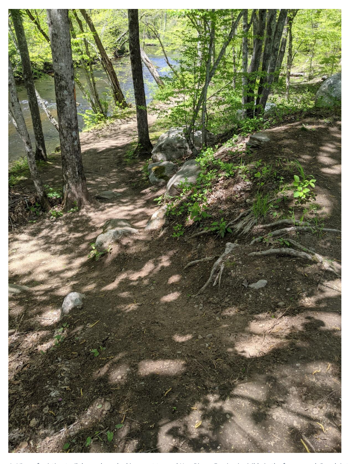
1- View of existing trail down slope, looking west toward Hop River. Erosion is visible in the foreground. Bench is to the right of photo.